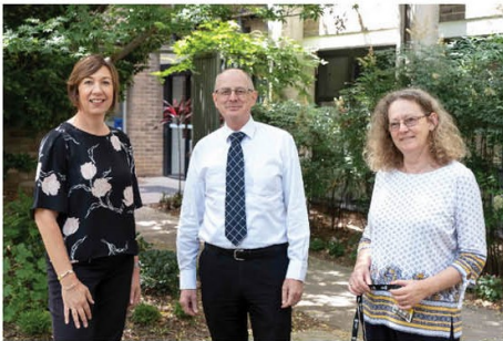
Careers and Employment and The Learning Centre have recently joined the PVC (Education) Portfolio

PVC(E) Welcomes Student Academic & Career Success Team